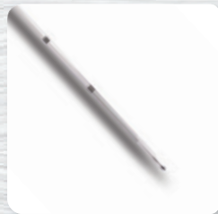
Echogenic, marked Trocar needle

The GaltStick® Introducer System is a 6 French Coaxial sheath assembly with stiffening stylet. The GaltStick® allows for the introduction of a .018" guidewire and .038" working guidewire in percutaneous procedures.