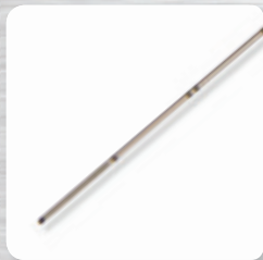
Echogenic, marked Chiba needle