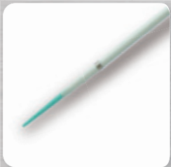
Embedded radiopaque marker band on all sheaths